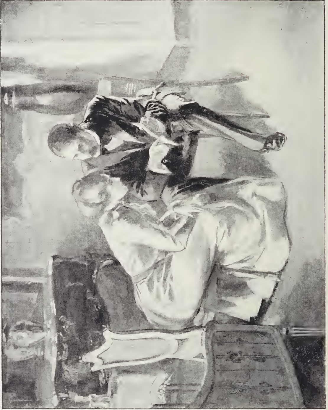
“WHAT ARE THOSE TWO WORDS, MISS LIVINGSTONE? I CAN'T QUITE MAKE THEM OUT.”